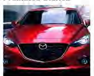
The 10 Best Cars for Under $25k (Kalley Blue Book)