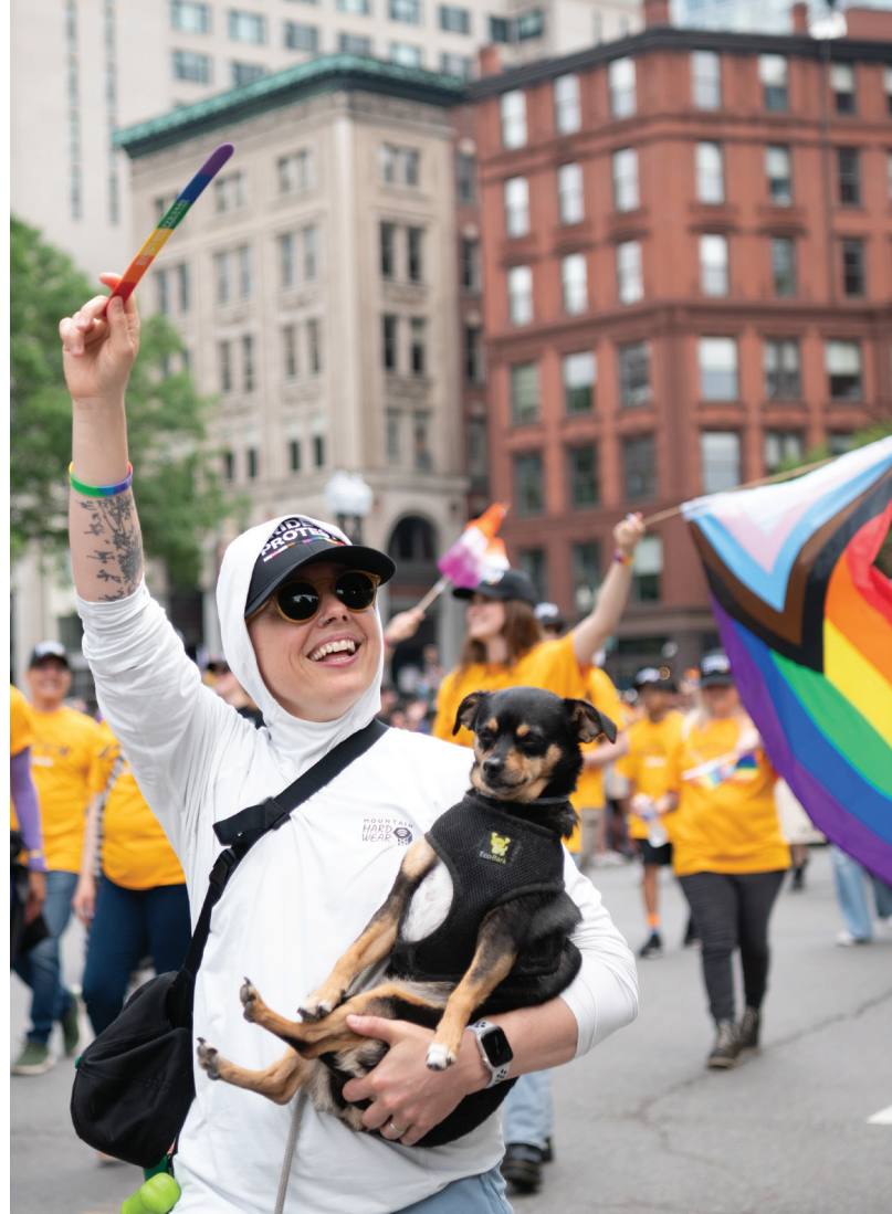
→ From Boston to North Brookfield, the ACLU of Massachusetts showed up for LGBTQ pride and equality.