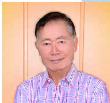
Actor, activist and ACLU honoree George Takei has spoken out against "Religious Freedom Restoration Acts."