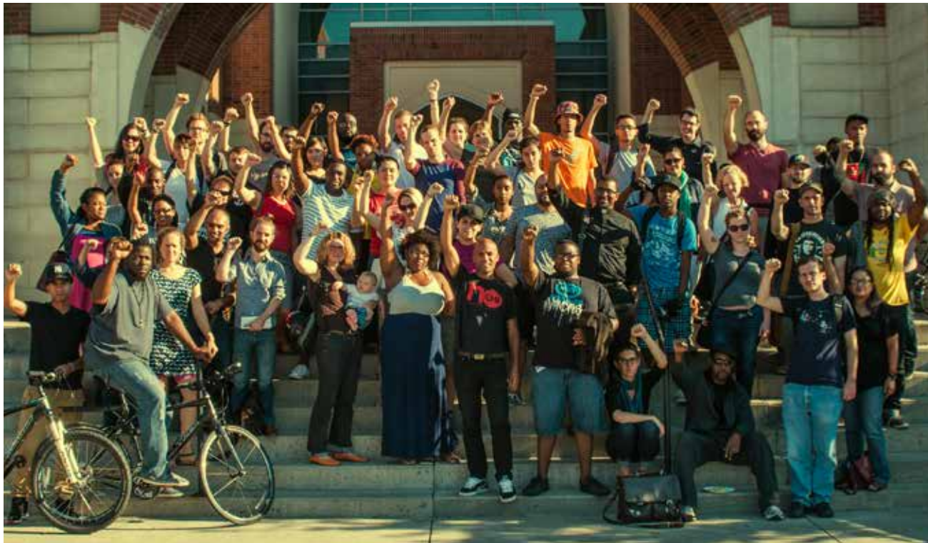
Community members unite against racially discriminatory policing last fall, outside the Islamic Society of Boston Cultural Center, after a meeting with ACLU speakers.