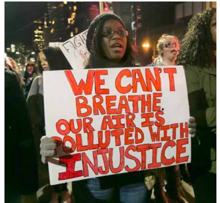
A protestor demands justice for victims of police violence in a December rally at Boston Common that brought thousands of people to the streets.