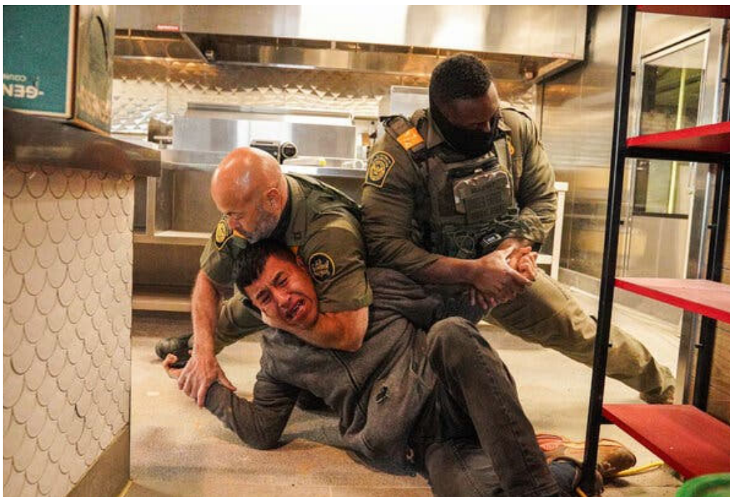
Figure 2: Chokehold in North Carolina