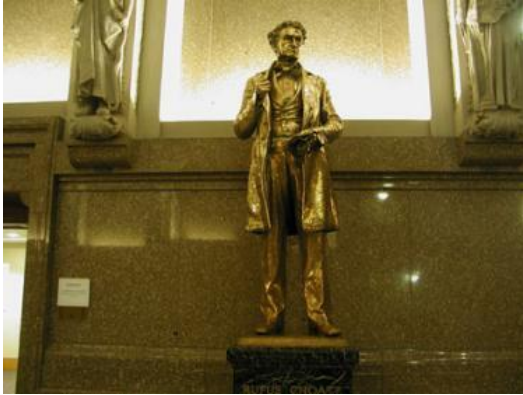
Rufus Choate statue by Daniel Chester French