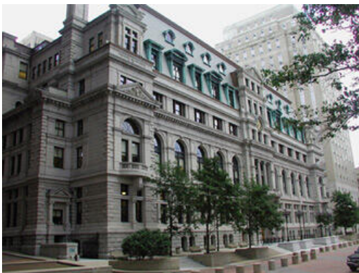
John Adams Courthouse

Designed by Boston city architect George A. Clough (1843-1916), the courthouse was completed in 1894 at a cost of approximately $3.8 million. Clough's reliance on classical elements such as arches, columns, pediments (triangular forms), and cornices (ornamental moldings) typifies this period of American architecture.